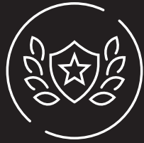
IMAGE AND RECOGNITION FORM THE FOUNDATION OF MOST COMPANIES' BRANDS

From logos to packaging, every detail serves as a crucial customer touchpoint. Commercial vehicles function as mobile marketing platforms. At Axalta Coating Systems, we recognize the significance of brand and image to our customers. As a result, we've ensured that our high-quality commercial vehicle paint system, PercoTop®, not only enhances aesthetics but also delivers in colour, performance, and reliability.