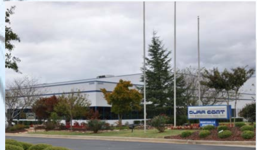
Huntsville, Alabama DuraCoat Headquarters

Dura Coat division offers a family of high-performance, scratch-resistant coatings that are developed with advanced formulations using low-emission resins, cool pigments, and energy-saving manufacturing methods—products that meet our customers' durability requirements as well as support their creative vision. We pride ourselves on innovative research and development, product quality and uniformity, and a focus on customer needs, including custom manufacturing and high-level technical support.